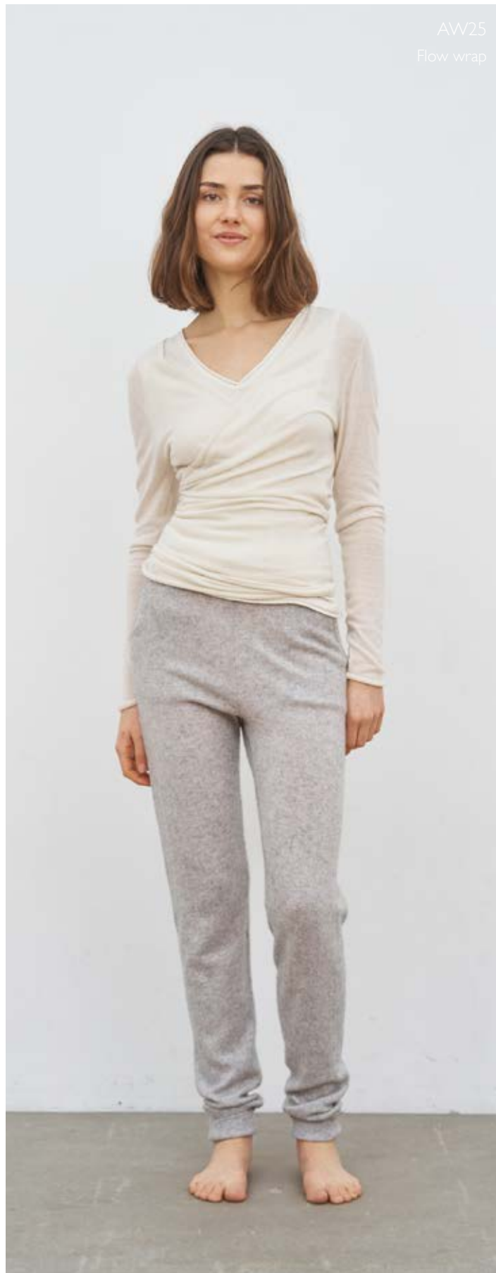
AW25 Flow wrap