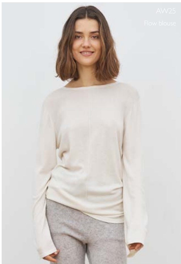
AW25 Flow blouse