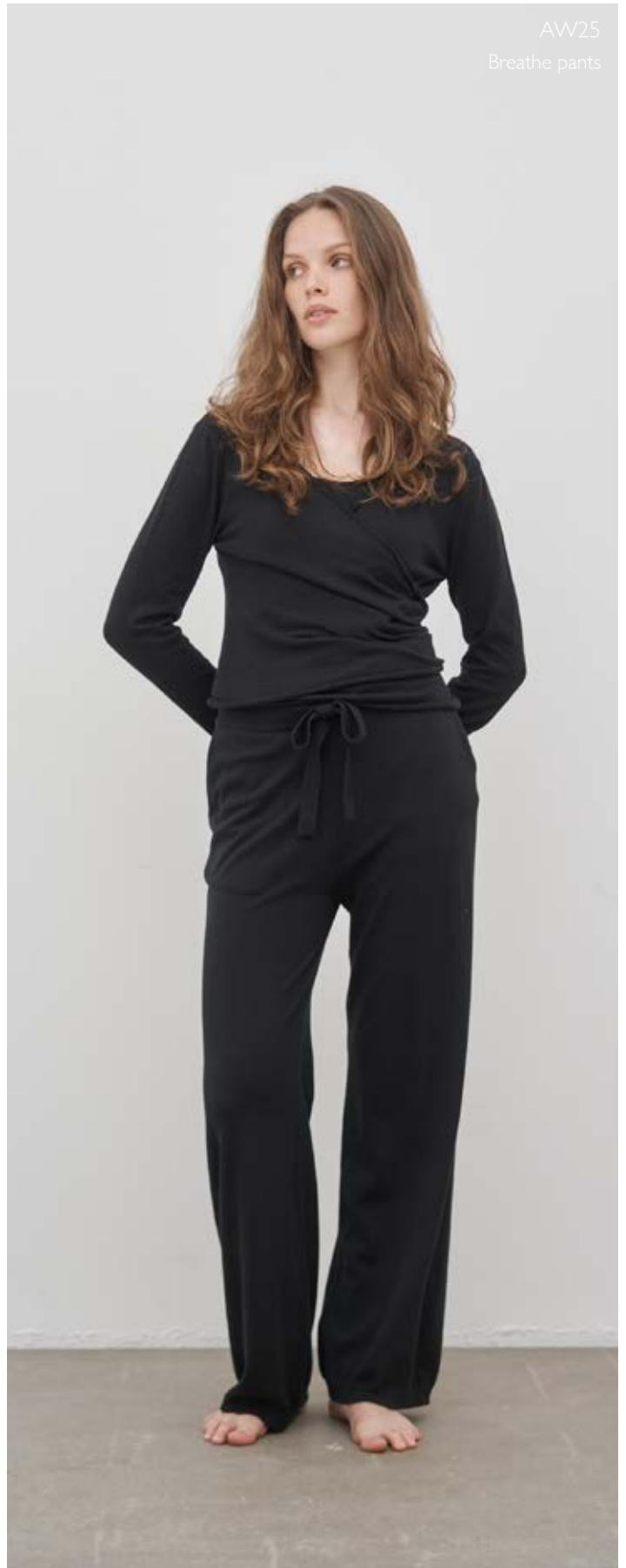
AW25 Breathe pants