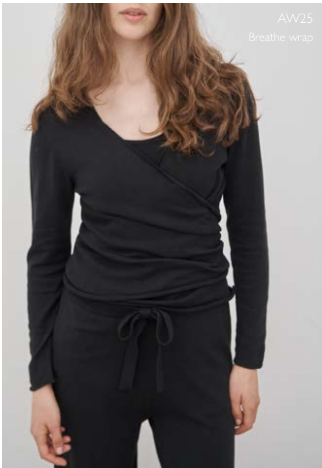
AW25 Breathe wrap