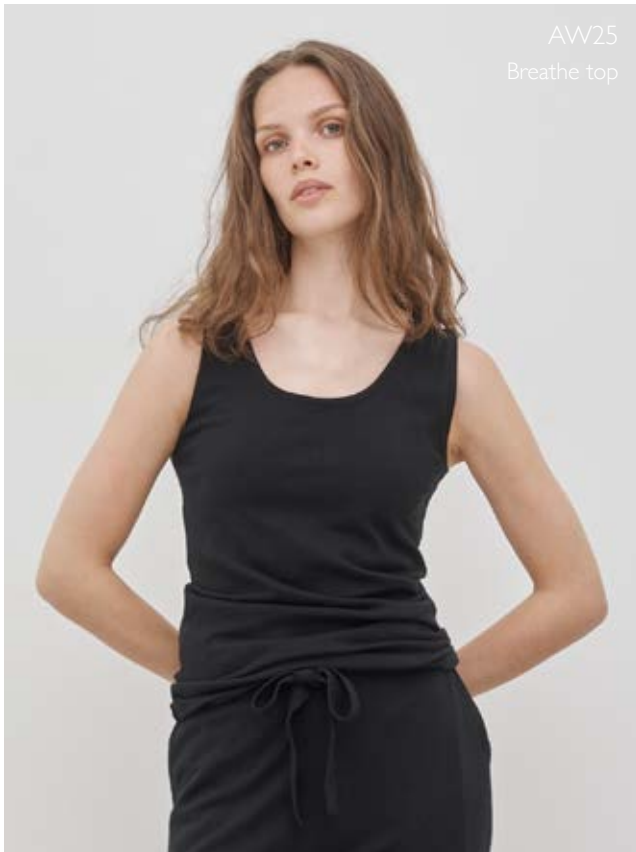
AW25 Breathe top