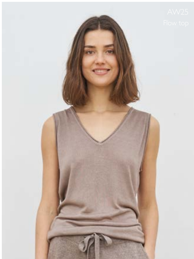
AW25 Flow top